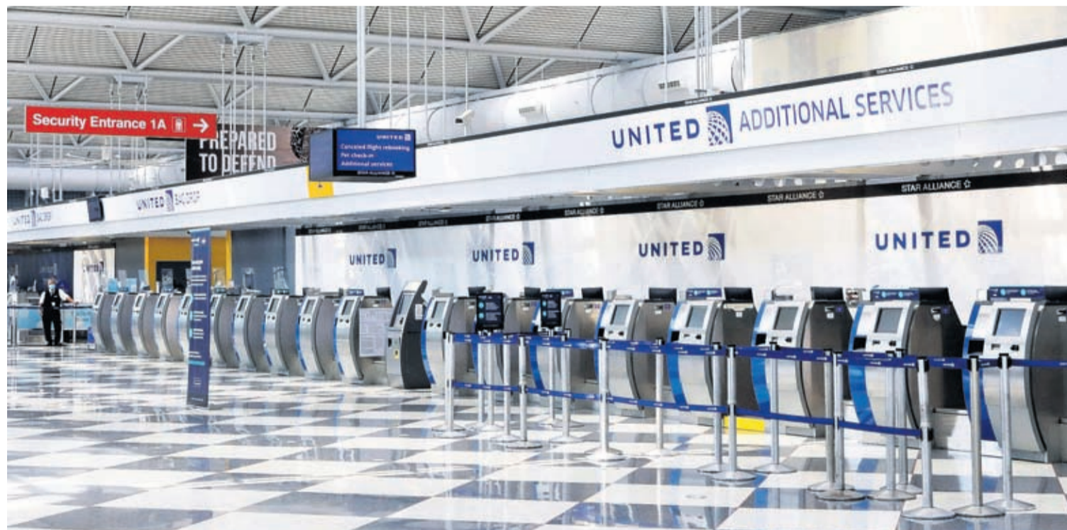
In this June 25, 2020, file photo, rows of United Airlines check-in counters at O'Hare International Airport in Chicago are unoccupied amid the coronavirus pandemic.